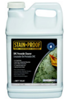
SMC Peroxide Cleaner