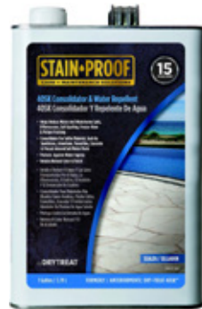
40SK Consolidator & Water Repellent