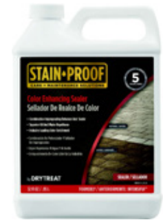
Color Enhancing Sealer