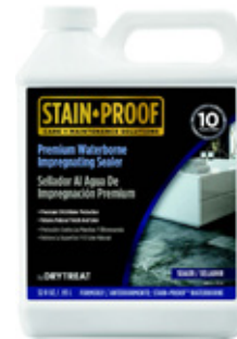
Premium Waterborne Impregnating Sealer