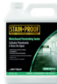
Waterbased Penetrating Sealer