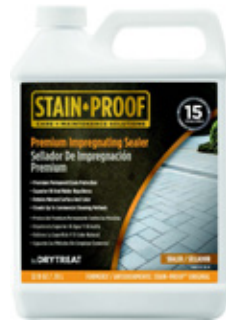
Premium Impregnating Sealer