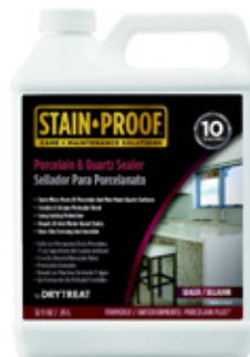
Porcelain & Quartz Sealer