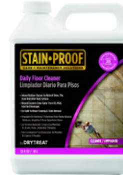
Daily Floor Cleaner