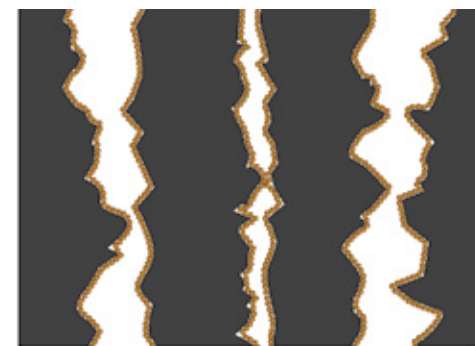
SIZE OF DRY-TREAT'S SEALING MOLECULE