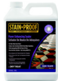
Paver Enhancing Sealer