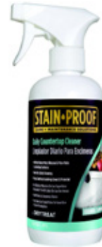
Daily Countertop Cleaner