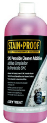
SMC Peroxide Cleaner Additive