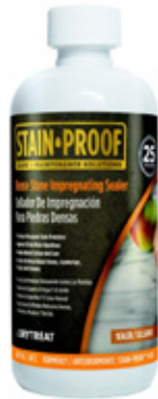
Dense Stone Impregnating Sealer