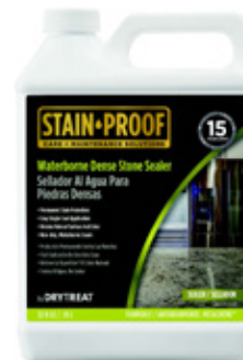
Waterborne Dense Stone Sealer